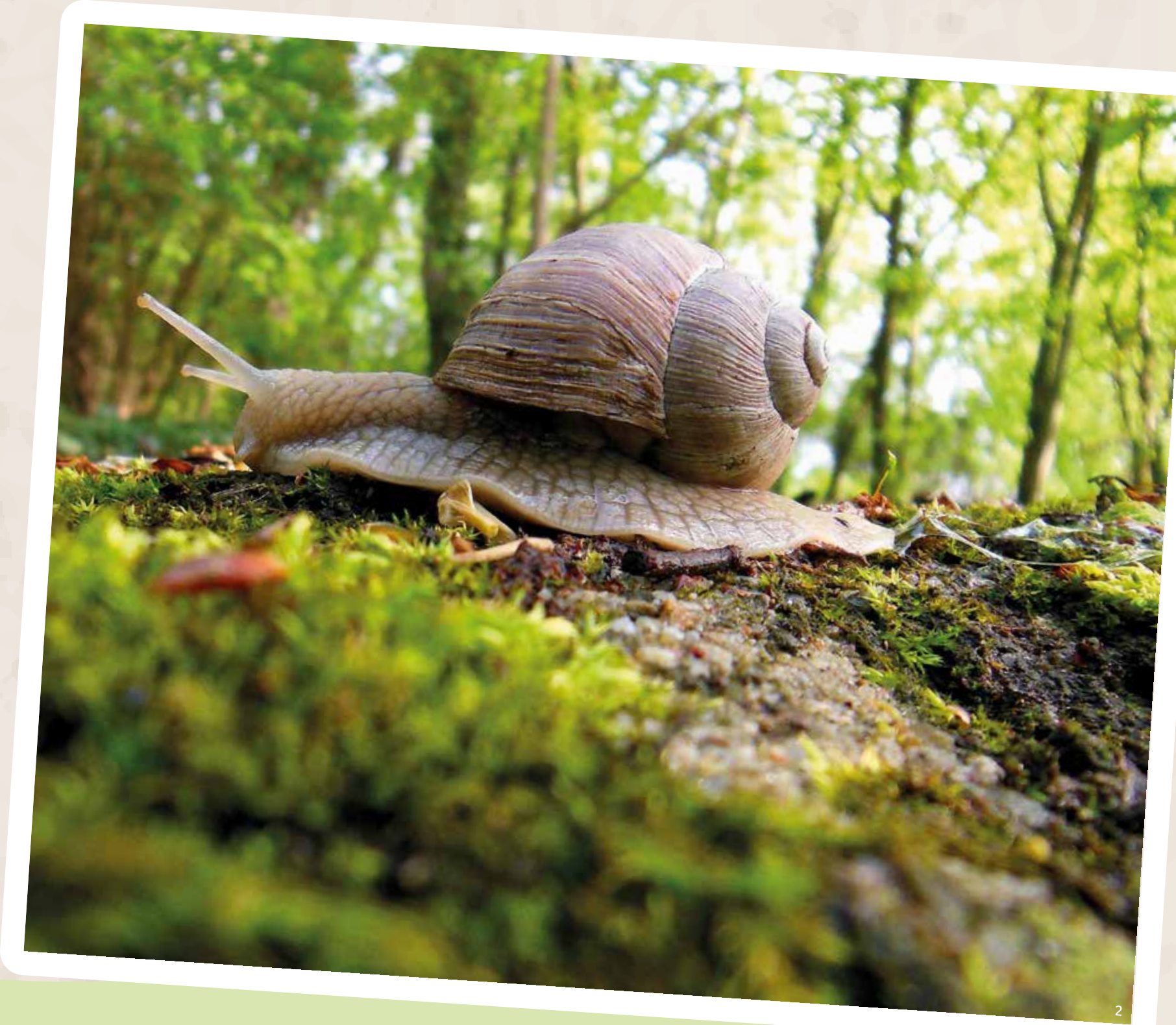
The HERB LAYER is the ground floor of the forest and accommodates beetles, woodlice and snails, but also mice and hedgehogs.