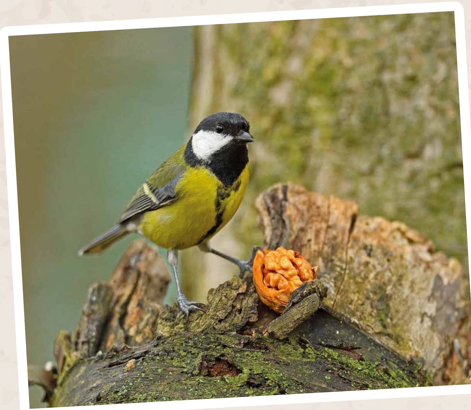
The fourth and last floor is the TREE LAYER . Here you will find cave-dwelling animals like woodpeckers, squirrels and dormice just as much as songbirds, who hide in the treetops.