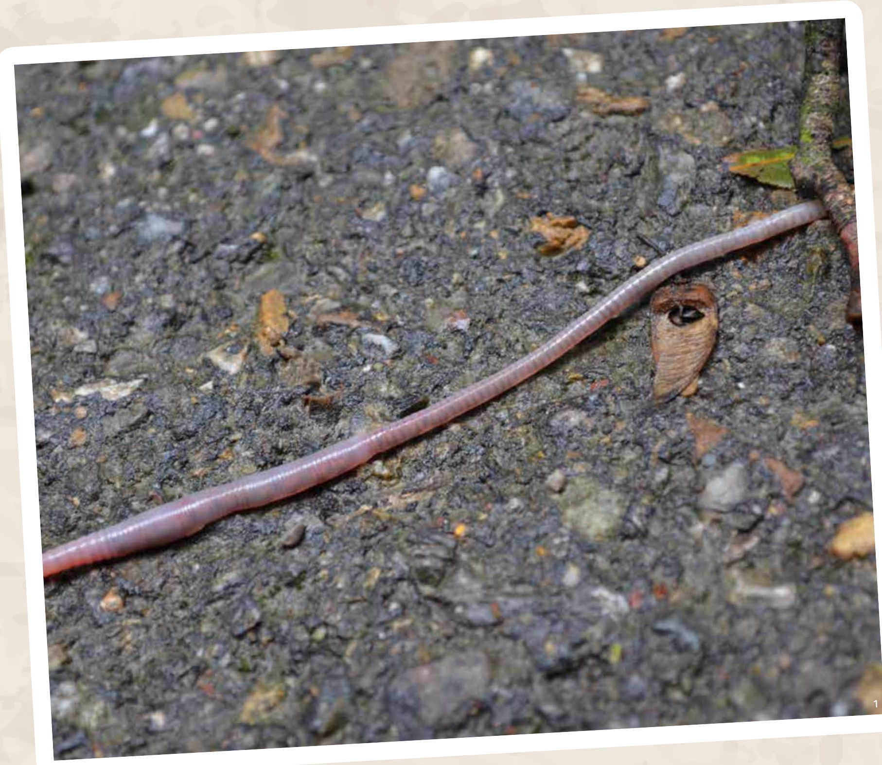
The lowest floor of the forest, the basement, is called the SOIL LAYER . This is where earthworms and centipedes crawl, and it is also the playground of lichens, mosses and small mushrooms.