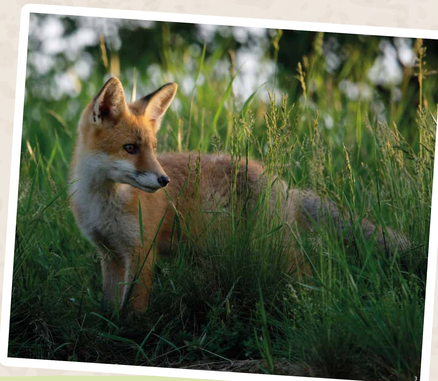
In the SHRUB LAYER of the forest larger mammals such as foxes, deer and wild boar romp about. Songbirds search here for berries.